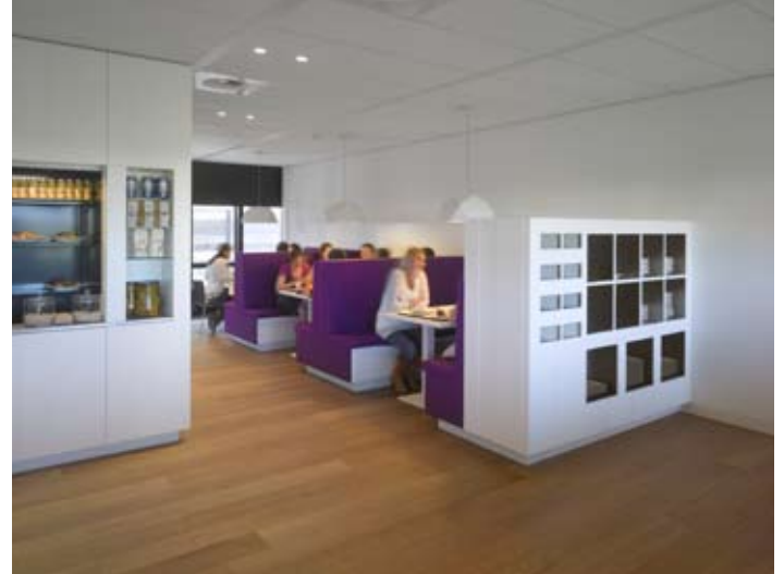
RESTAURANT AT PELS RIJCKEN DURING THE LUNCH