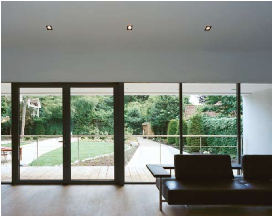
VIEW FROM THE LIVING ROOM AT THE GARDEN