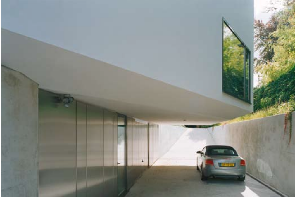
IMPRESSION WITH PANORAMA WINDOW