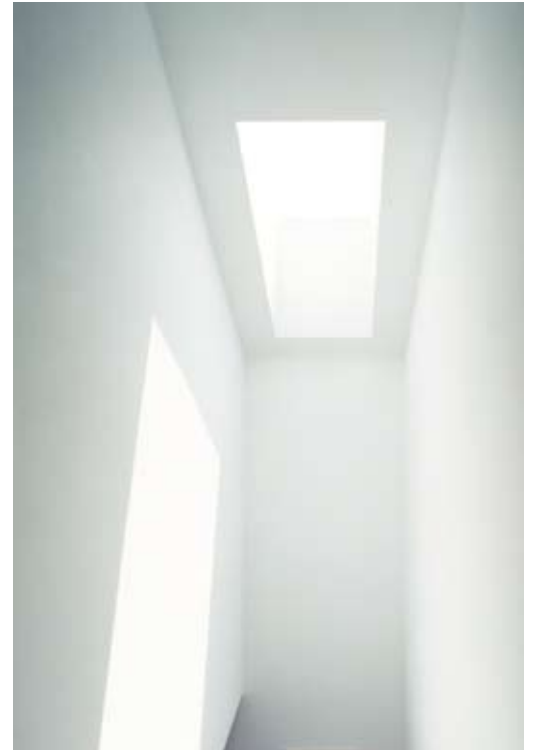
DETAIL OF THE ROOFLIGHT ABOVE THE STAIRS